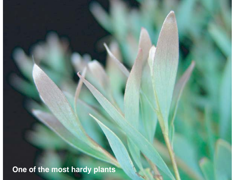
One of the most hardy plants

Hakea salicifolia is known for its toughness, but is also considered to get untidy as it gets older. Once established, they are one of the most hardy of plants. They withstand long periods of drought and moderately wet conditions, as well as cold and windy positions. They are highly frost tolerant. It can tolerate some salt spray and is also a fire retarder. Another great thing about Hakea salicifolia is that they are normally pest free, probably because of their tough resilient foliage and stems.