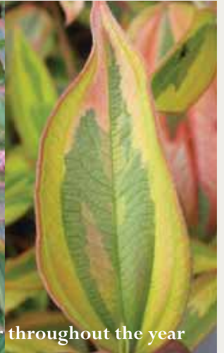
Splashes of colour throughout the year