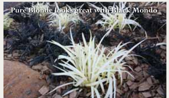
Pure Blonde looks great with Black Mondo